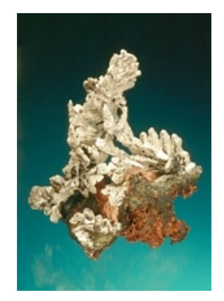
Figure 128: Native silver with copper from the Cliff mine, Keweenaw County, 9.5 x 10.5 cm, A. E. Seaman Mineral Museum specimen No. LLH 508, Jeffrey Scovil photograph.

Classic specimens of crystallized native silver have long been obtained and eagerly sought from the native copper deposits. The history of Michigan silver has been reviewed by Olson (1986). Many of the details presented below are abstracted from his account. Although silver was produced in relatively large amounts, it commonly was not recorded under company production records, as both miners and managers regarded it as their personal and private property whenever it came within their reach. By 1977 the recorded silver production for the district was 16,469,544 troy ounces, but the actual total may have been twice as much.