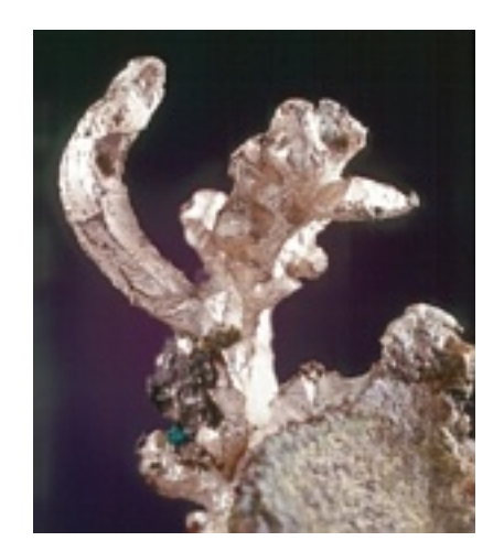
Figure 129: A curved, elongated crystal of native silver from the South Kearsarge mine, Kearsarge, Houghton County, 3.5 x 5 cm area, A. E. Seaman Mineral Museum specimen No. JTR 395, George Robinson photograph.