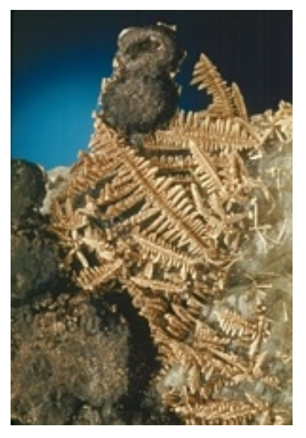
Figure 132: Dendritic silver crystals with domeykite in calcite from the White Pine mine, White Pine, Ontonagon County, approximately 3.5 cm area, Michael P. Basal collection, Jeffrey Scovil photograph.

Baraga County: Two "old silver pits" occur in section 23, T51N, R30W on Robarge Creek. Also shown on the county map is the "Old Silver Mine" on Silver River in section 6, T50N, R32W. No published reports on the geology and mineralogy of these localities are available.