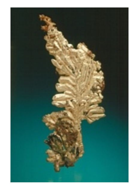
Figure 130: A 2 x 7.5 cm fern-like growth of crystals native silver from the Quincy mine, Hancock, Houghton County, A. E. Seaman Mineral Museum specimen No. DCG 665, Jeffrey Scovil photograph.

mineral. Mine managers ordered newly hired miners to "just set aside the white copper for me and I'll pick it up later." In many bars miners paid for their drinks in silver specimens. Others melted down the silver and sold it to jewelers. It is told that a Wolverine mine superintendent remarked that all the automobiles in Gay should have belonged to the Calumet and Hecla Company, inasmuch as they were paid for with high-graded silver.