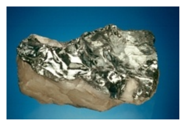
Figure 94: Hematite, specular hematite in quartz from the Cascade mine, near Marquette, Marquette County, 8 × 13 cm, A. E. Seaman Mineral Museum specimen No. DM 5926, Jeffrey Scovil photograph.

Because of the abundance of the mineral and its exceedingly numerous occurrences, only a few of the outstanding or unusual occurrences are listed.