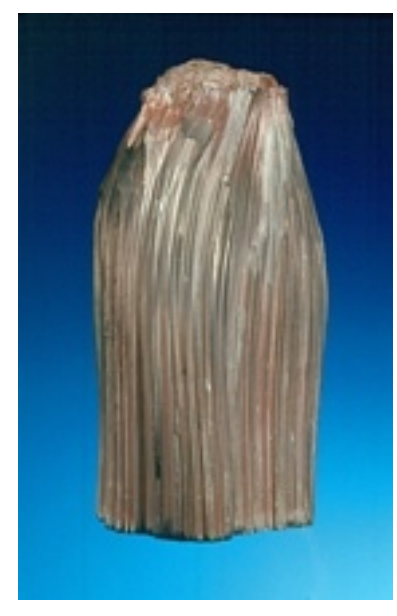
figure 93: Hematite, "needle ore" probably from the Norrie mine, Ironwood, Gogebic County, 5 x 11.5 cm, A. E. Seaman Mineral Museum specimen No. JWVR 259, Jeffrey Scovil photograph.