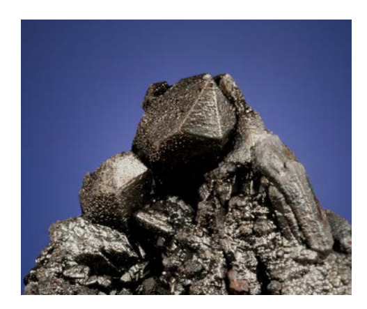
Black botryoidal hematite coating quartz crystals from the Rock Dam gold prospect, Dickinson County; 3 x 4 cm area. A. E. Seaman Mineral Museum specimen DM 25795, George Robinson photograph.

Dickinson County: Rock Dam gold prospect near Pine Creek (SW <sup>1</sup>/<sub>4</sub> SE <sup>1</sup>/<sub>4</sub> section 31, T41N, R29W): As attractive dark brown-to-black botryoidal coatings on crystals of milky quartz (q.v.). (Carlson et al., 2007b).