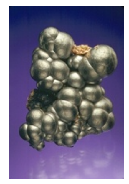
Figure 95: Botryoidal hollandite from Wakefield, Gogebic County. 4 x 5 cm. A. E. Seaman Mineral Museum specimen No. CVW 9, Jeffrey Scovil photograph.

Because of the abundance of the mineral and its exceedingly numerous occurrences, only a few of the outstanding or unusual occurrences are listed.