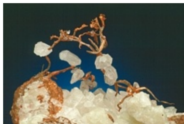
Figure 61: Native copper, wire copper with datolite from the Osceola mine, Calumet, Houghton County, field of view 7 cm, A. E. Seaman Mineral Museum specimen No. JTR 1671, Jeffrey Scovil photograph.

Alteration: Copper from many of the mines is coated by a patina of reddish cuprite or black tenorite, which, in some instances, may have formed after the mines were opened. However, in some deposits, particularly in higher levels, the