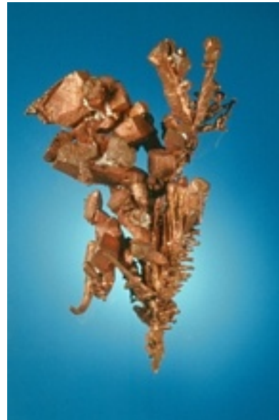
Figure 64: Native copper, dendritic growth of cubic crystals from the Calumet and Hecla mine, Calumet, Houghton County, 5.5 x 8.5 cm, A. E. Seaman Mineral Museum specimen No. JTR 674, Jeffrey Scovil photograph.