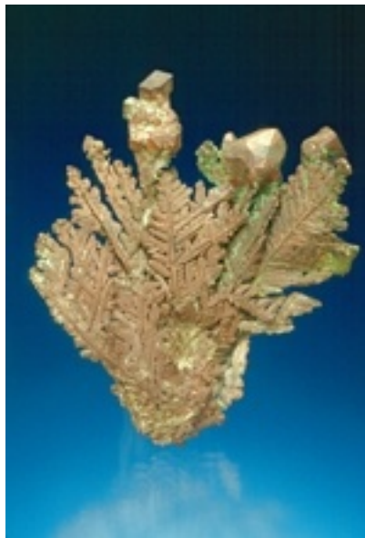
Figure 63: Native copper, “Fern” copper from the Phoenix mine, Phoenix, Keweenaw County, 4.5 x 5.5 cm, A. E. Seaman Mineral Museum specimen No. JTR 1664, Jeffrey Scovil photograph.

Dickinson County: 1. Cyclops mine at Norway: Float copper in drift above the iron ore body. 2. Reportedly the largest mass of float copper found in Dickinson County was uncovered in the early 1940s during excavation for a filling