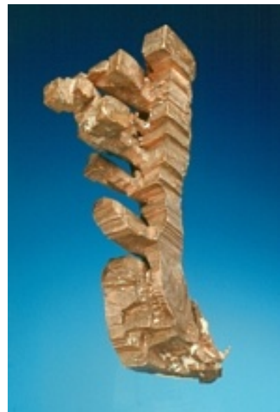
Figure 65: Native copper, parallel growth of cubic crystals, Lake Superior copper district, 2.5 x 7.5 cm, A. E. Seaman Mineral Museum specimen No. GBR 569, Jeffrey Scovil photograph.