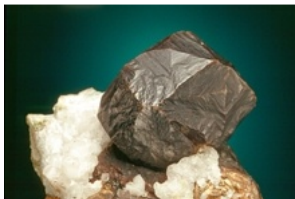
Figure 62: Native copper, a rare, 2 cm, hexoctahedral copper crystal from the Osceola mine, Calumet, Houghton County, A. E. Seaman Mineral Museum specimen No. JTR 1672, Jeffrey Scovil photograph.

The most common habit is tetrahedral, with {014} and {025} the most common forms. These may be combined with the cube, dodecahedron, or (rarely) octahedron. The cube alone is also relatively common, the dodecahedron less common, and the octahedral form alone much less common. Wilson and Dyl (1992) showed that crystal habit may be related to crystal size. In a preliminary study “of copper crystals 4 mm or less in diameter, in close association with prehnite and commonly also with quartz and calcite..nearly 70% of the copper crystals with identifiable forms proved to be the tetrahedron {057}, and half the remainder are this form modified to some extent by the dodecahedron.” Larger crystals were found to have a higher proportion of other tetrahedron forms, along with the cube, octahedron, and dodecahedron. Figures 60 to 66 illustrate some of these forms.