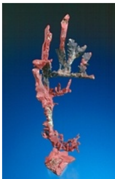
Figure 60: Native copper with cuprite (red) and tenorite (black) patina from the Central mine, Central, Keweenaw County. 4.5 x 12 cm. A. E. Seaman Mineral Museum specimen No. JTR 537, Jeffrey Scovil photograph.

Native copper is easily the most famous of Michigan's minerals. As an ore mineral, native copper is very rare throughout the world, although minor occurrences are widespread. The greatest native copper deposits ever found and exploited are those of the Keweenaw Peninsula in Michigan's Northern Peninsula. Copper mineralization occurs along a narrow belt over 150 kilometers long, stretching southwestward through Keweenaw, Houghton, and Ontonagon Counties (Part I). There, native copper occurs in amygdaloids, conglomerates, and fissures ranging in size from microscopic grains up to masses 14 meters long and weighing 382 metric tons (Rickard, 1905). Similarly large masses of float copper have been found in glacial drift, particularly in the Northern Peninsula. (Rickard, 1905; Kraus, 1924), though native copper erratics are known in glacial drift in Wisconsin, Iowa, Illinois (Crook, 1929), Indiana, Ohio, Western New York, and Pennsylvania. While these large masses of copper