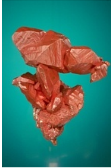
Figure 66: Native copper, twinned tetrahedrons from the Central mine, Central, Keweenaw County, 6 x 8 cm, A. E. Seaman Mineral Museum specimen No. DCG 1110, Jeffrey Scovil photograph.

station in Iron Mountain. It is estimated to have been about a meter across, 1 - 2 cm thick, and "only slightly oxidized" (B. J. Westman, written communication, 1983).