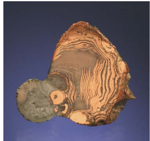
A 7 cm branching aggregate of cubic copper crystals from the Moyle Construction Quarry in Houghton, Houghton County; A. E. Seaman Mineral Museum specimen DM 28332, George Robinson photograph.