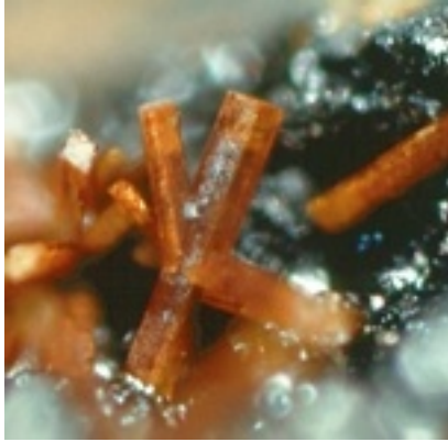
Figure 105: Orientite crystals to 0.6 mm from the Manganese mine, near Lake Manganese, Keweenaw County. Ramon DeMark specimen, Dan Behnke photograph.

A very rare manganese mineral. Northern Peninsula.