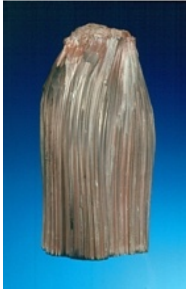
figure 93: Hematite, “needle ore” probably from the Norrie mine, Ironwood, Gogebic County, 5 x 11.5 cm, A. E. Seaman Mineral Museum specimen No. JWVR 259.