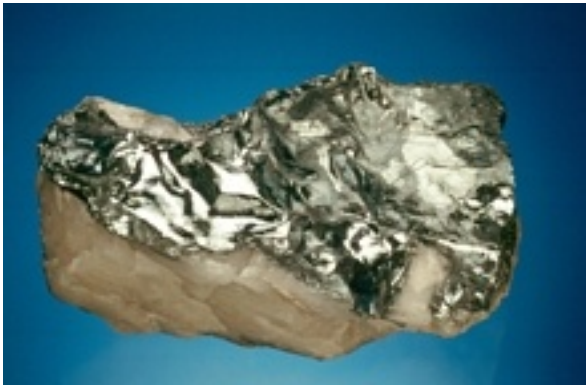
Figure 94: Hematite, specular hematite in quartz from the Cascade mine, near Marquette, Marquette County, 8 x 13 cm, A. E. Seaman Mineral Museum specimen No. DM 5926, Jeffrey Scovil photograph.

Because of the abundance of the mineral and its exceedingly numerous occurrences, only a few of the outstanding or unusual occurrences are listed.