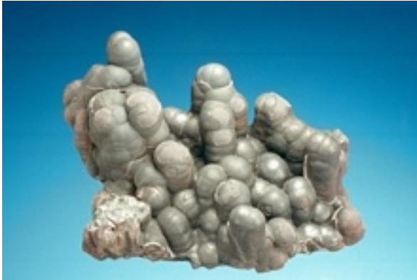
Figure 91: Hematite, stalactitic "grape ore" from Ironwood, Gogebic County, 8 x 13 cm, A. E. Seaman Mineral Museum No. CVW 6, Jeffrey Scovil photograph.

The most widely distributed iron oxide mineral and one of the most important and abundant iron ores. Formed under a wide variety of geological environments: 1) as an uncommon accessory mineral in a few igneous rocks, 2) as a constituent of some high-temperature, hydrothermal veins, 3) as a widespread and abundant sedimentary species in numerous rock types (ferruginous shales, sandstones, limestones, and sedimentary hematite ores), 4) as a major constituent of metamorphosed sedimentary iron formation (hematite schist, jasper, and jaspilite), and 5) as a weathering product of various iron-rich rocks (gossan). Like goethite, hematite appears in a variety of aggregate forms, the most important of which in Michigan are: