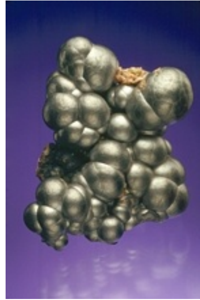
Figure 95: Botryoidal hollandite from Wakefield, Gogebic County. 4 x 5 cm. A. E. Seaman Mineral Museum specimen No. CVW 9, Jeffrey Scovil photograph.