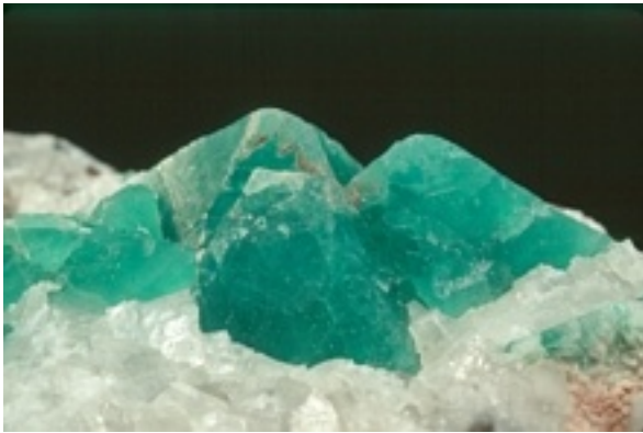
Figure 78: Fluorite crystals in calcite on conglomerate from near Eagle River, Keweenaw County. Largest crystal is 1.5 cm across. A. E. Seaman Mineral Museum specimen No. DM 15702.

Bay County: Quarry just east of Bay City on M-25: Brown, 5 mm cubes in vugs in limestone.