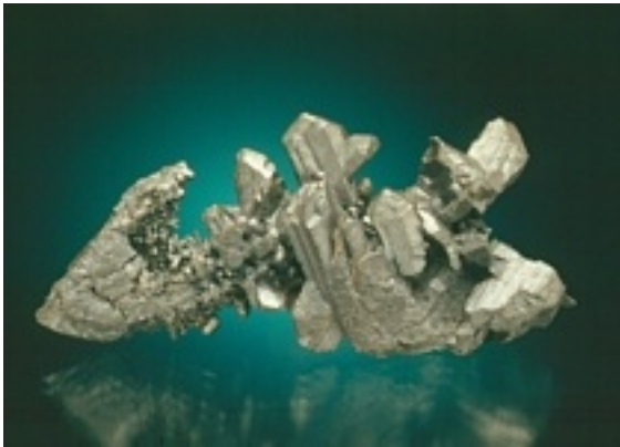
Figure 54: Chalcocite crystals from the White Pine mine, White Pine, Ontonagon County. 3 x 5.5 cm. Shawn M. Carlson collection, Jeffrey Scovil photograph.

Widespread, but historically not significant as an ore mineral in Michigan, except at the White Pine deposit; in fissure veins cutting various rocks of the native copper lodes and locally disseminated in the lodes themselves; also present in a variety of metalliferous veins. Twelve chalcocite deposits have been located on the Keweenaw Peninsula, the most notable being the Mount Bohemia and Gratiot Lake deposits (Robertson, 1975; Maki, 1999). Maki (1999) estimates the Gratiot Lake deposit may contain as much as 4.5 million metric tons of ore with an average grade of 2.3% copper. Northern Peninsula.