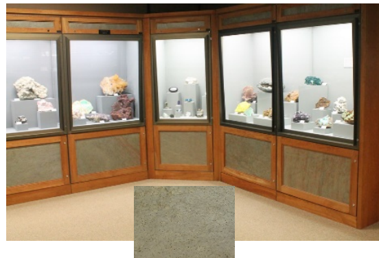
(6) Mineral Treasures gallery with garnet schist door panel in inset