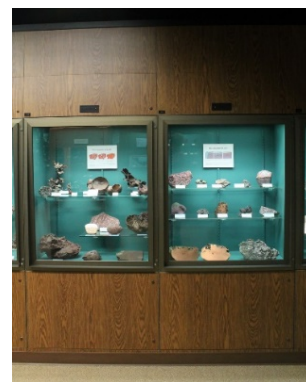
(13) Wall cases not yet refurbished