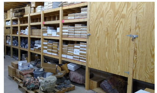
(10) Annex gift shop and collection storage