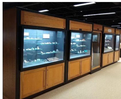
(12) Floor cases refurbished