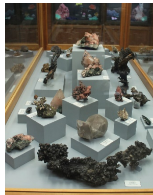
(9) Plinths in highlight case