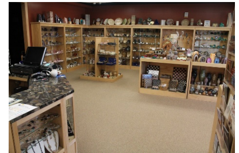
(7) Gift shop