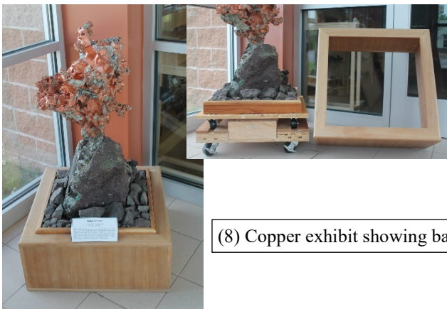
(8) Copper exhibit showing base