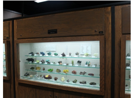
(4) Floor case with black strips