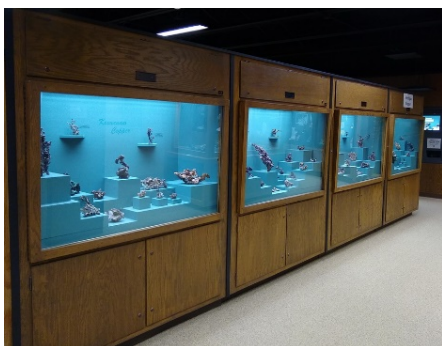
(11) Floor cases not yet refurbished