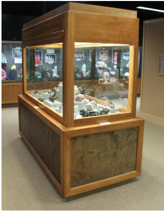
(1) Keweenaw highlight case