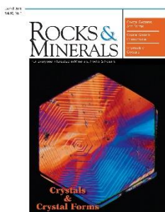
Growth spiral on natural graphite