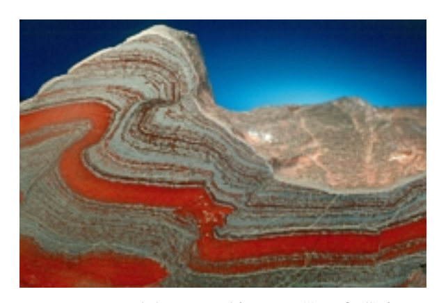
Figure 116: Banded jasper and hematite ("jaspilite") from Jasper Knob, Ishpeming, Marquette County. Field of view 6 x 7 cm. A. E. Seaman Mineral Museum specimen No. DM 10116, Jeffrey Scovil photograph.

10. Empire mine, Palmer: Amethyst (Morris, 1983). Similar specimens at the Tilden mine, nearby (DeMark, 2000). Near the end of its production a zone containing amethyst crystals over 20 cm long was encountered in the old Empire pit. A number of these showed ameythst to greenish citrine color zones, reminiscent of the popular gemstone "ametrine" (Tsu-Ming Han, personal communication, 2002). 11. Color-banded quartz veins cut the altered peridotite on Presque Isle.