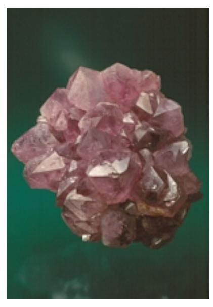
Figure 114: Quartz (variety amethyst) from Seven Mile Point, Keweenaw County. A. E. Seaman Mineral Museum specimen No. DCG 1420, Jeffrey Scovil photograph.

Keweenaw County: 1. Copper district generally: Chalcedony and agate are abundant near top of Kearsarge flow. Quartz is an abundant accessory mineral in numerous amygdaloid and fissure lodes. Fine colorless crystals with prehnite were formerly found at the Central mine . 2. Mohawk mine: Crystals from fissure veins. 3. Seneca mine : Crystals from fissure veins (1-3, Stoiber and Davidson, 1959). 4. Keweenaw Point beaches: Pebbles of amethyst and smoky quartz were first recorded by Schoolcraft in 1824. Amethyst-lined vugs in beach pebbles have been