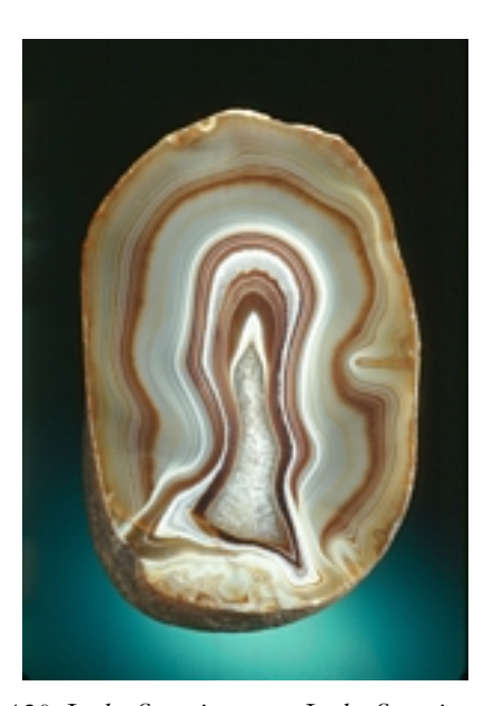
Figure 120: Lake Superior agate, Lake Superior, Michigan, 7 x 9.5 cm, A. E. Seaman Mineral Museum specimen No. JTR 1005, Jeffrey Scovil photograph.

Ontonagon County: 1. Lake Superior beaches near Ontonagon: Agate pebbles (Mihelcic, 1954). 2. Gull Point on M-64: Agate beach pebbles. 3. Porcupine Mountains: As milky crystals in vugs and amethystine radial aggregates in veins with chalcopyrite, purple fluorite, and sphalerite (University of Michigan collection). In the Porcupine Mountains, Carp River, and White Pine quadrangles a felsite layer contains vesicles with quartz and "some quartz in vesicles is pseudomorphic after platy crystals of tridymite" (Hubbard, 1975, page 524). The layer is in the