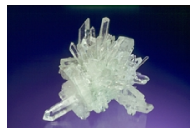
Figure 112: Crystallized quartz from the Red Jacket Shaft, Calumet and Hecla mine, Calumet, Houghton County. 8.5 x 8.5 cm. A. E. Seaman Mineral Museum specimen No. DCG 2218, Jeffrey Scovil photograph.

Houghton County: 1. Copper deposits generally: Quartz forms veins, vesicle fillings, and replacements of other minerals and rock. It occurs most abundantly in the Isle Royale lode, plentifully in the Baltic and Pewabic lodes, and locally in the Osceola and Kearsarge lodes. Chalcedony appears as vug linings in the Pewabic lode and as amygdule fillings in the Kearsarge lode. It also replaces zoisite and calcite (Butler and Burbank, 1929). 2. Franklin mine: Centimeter-sized crystals with prehnite. 3. Tamarack mine: Colorless, white, and pale green crystals (some due to frosted coating of prehnite). 4. Isle Royale mine: Colorless crystals to 5 cm, some with calcite and barite; fine specimens. Also veins of massive quartz. 5. Osceola mine: Crystals with prehnite. 6. Wolverine mine: In crystals and as agate with copper bands. 7. Laurium mine: Abundant as colorless prismatic crystals with epidote, pumpellyite, and calcite in amygdules in basalt; rarely colored blue due to inclusions of kinoite (q.v.). 8. Baltic Number 2 mine: Veins of massive quartz. 9. Centennial mine: In fine specimens of colorless crystals with epidote. 10. Calumet and Hecla mine, Red Jacket Shaft: Superb groups of lustrous, colorless crystals to 5 cm in length. Some occur with epidote and "pumpellyite," others are tinted pale green by chlorite inclusions. Among the finest quartz specimens known from Michigan. 11. Mesnard mine: Small crystals with prehnite and calcite.