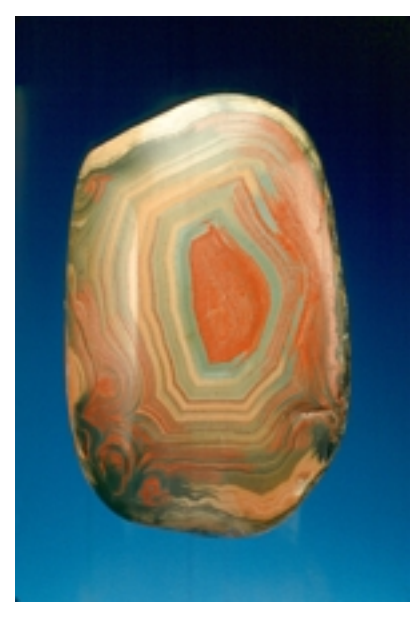
Figure 118: Lake Superior agate, Keweenaw County, 3 x 4 cm, A. E. Seaman Mineral Museum specimen No. DCG 1056, Jeffrey Scovil photograph.