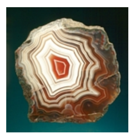
Figure 117: Lake Superior agate, Lake Superior, Michigan, 5 x 5.5 cm, A. E. Seaman Mineral Museum specimen No. JTR 997, Jeffrey Scovil photograph.

Monroe County: 1. Navarre quarries on Plum Creek near Monroe: Transparent quartz crystals as cavity lining and encrustation with associated dolomite. 2. Point aux Peaux, Stony Point, and Brest quarries near Monroe: Rare amethyst as cavity fillings and encrustations associated with dolomite, calcite, celestine, and strontianite (Dana, 1892). 3. Dundee Formation: Brown, irregular chert nodules in seams and crevices and as thin beds between dolomite and limestone. Commonly enclose silicified fossils (2-4, Sherzer, 1900).