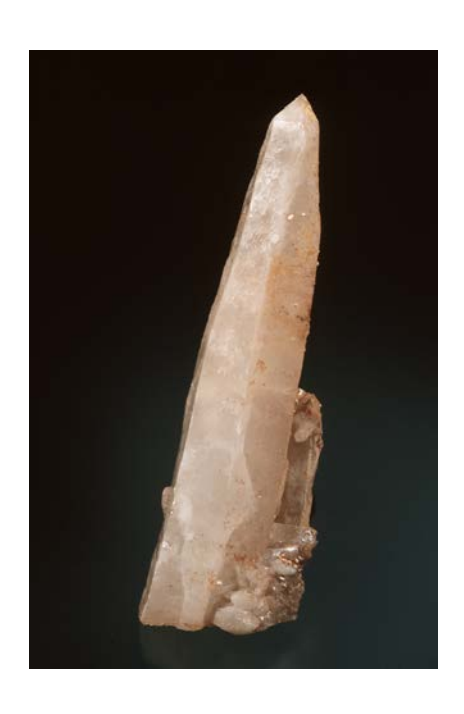
An 11 cm long milky quartz crystal from the Rock Dam gold prospect, Dickinson County. A. E. Seaman Mineral Museum specimen DM 27988