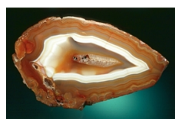
Figure 119: Lake Superior agate, Esrey Park, Keweenaw County, 10 x 20 cm, A. E. Seaman Mineral Museum specimen No. DCG 1365, Jeffrey Scovil photograph.