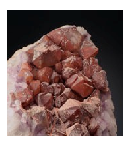
Amethyst from the Peska (Motte Construction) quarry near Rockland, Ontonagon County; 7.5 x 9 cm. A. E. Seaman Mineral Museum specimen DM 25715.