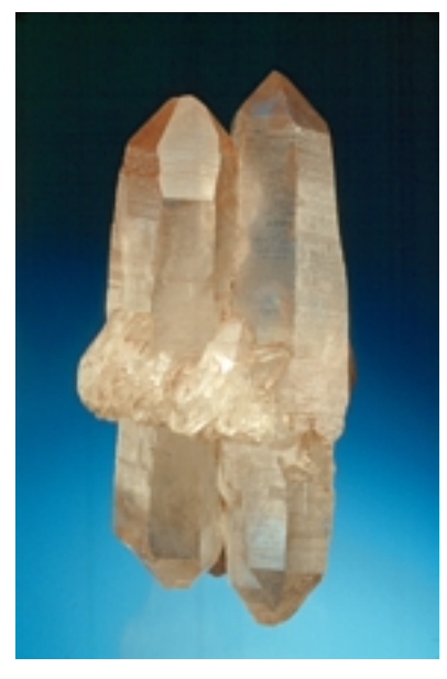
Figure 115: Quartz crystals from near Goose Lake, Marquette County. 4.5 x 8.5 cm. A. E. Seaman Mineral Museum specimen No. DM 22764.

Marquette County: 1. Marquette iron range generally: Siderite-chert rock in which the chert occurs in particles 5 to 10 microns across (Mann, 1953). "Jaspilite" (banded red jasper with hematite) is very well developed in ores of this range (Carr and Dutton, 1959). 2. Jackson mine, Negaunee: Jaspilite and in small colorless crystals with manganite in cavities in white quartz veins. 3. Jasper Knob, Ishpeming: Outstanding outcrop of folded jaspilite (Figure 10). Please note: collecting is not allowed. 4. Goose Lake, near Ishpeming: As well-formed, prismatic, colorless-to-milky crystals over 25 cm in length (specimen DM 19968, A. E. Seaman Mineral Museum, Michigan Technological University). The locality consists of a quartz vein north of Grace Lake, approximately 2 km east of Goose Lake; one of the best localities for quartz in the state (DeMark, 2000). 5. Along M-95, SE 1/4 NW 1/4 section 21, T47N, R29W (Snelgrove et al., 1944): Quartz in graphic granite in a pegmatite with feldspar and biotite. 6. SE 1/4 SE 1/4 section 23, T46N, R30W: Same type occurrence (Snelgrove et al., 1944). 7. Crockley pegmatite, section 22, T47N, R29W: Graphic granite (Heinrich, 1962a). 8. Mount Homer in the Huron Mountains: Graphic granite in a 70 cmwide pegmatite (Lane, 1907). 9. Partridge Island: Narrow agate veins in gabbro (Dana, 1892).