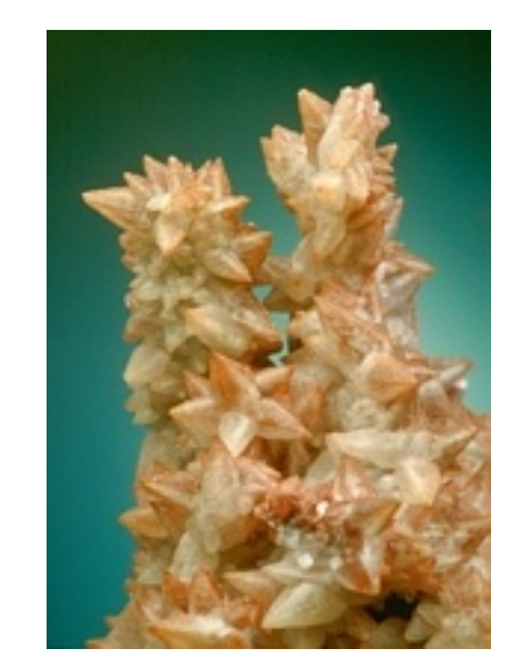
Figure 47: Calcite with hematite stains from the Vulcan mine, Vulcan, Dickinson County. Field of view 4 × 6 cm. A. E. Seaman Mineral Museum specimen No. DM 8909, George Robinson photograph.

Chippewa County: Neebish Island, approximately 32 km southeast of Sault Sainte Marie: Crystals in the Trenton Limestone (Mandarino, 1948).