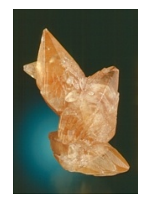
Figure 49: Calcite crystals from the France Stone Company quarry near Monroe, Monroe County. 3 × 5 cm. A. E. Seaman Mineral Museum specimen No. DM 23126, Jeffrey Scovil photograph.

(Rockwood Stone) Quarry, near Newport: Pale amber scalenohedral crystals to 8 cm with celestine.