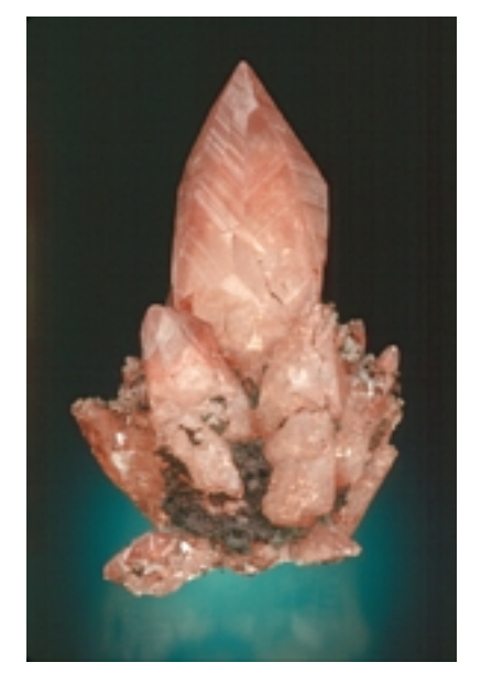
Figure 42: Calcite crystals with native copper inclusions from the Franklin mine, Hancock, Houghton County. 5.5 x 8.5 cm. A. E. Seaman Mineral Museum specimen No. JTR 320, Jeffrey Scovil photograph.

A very common and widespread rock-forming mineral. Calcite is the chief constituent of limestone and marbles and is also widespread as a hydrothermal (gangue) mineral in veins, lodes, and replacement deposits of a great variety of metallic mineralizations. In Michigan, outstanding calcite occurrences are of the following main types: 1) As exceptionally fine and complex crystals in cavities and veins in the Keweenaw native copper lodes. It is the most widespread mineral of the ore-forming period. This is a deservedly famous occurrence for this mineral, and its specimens grace mineral collections all over the world. 2) As crystals in cavities and veins in iron ores. 3) As vein-filling, concretion, and vug crystals in various limestone and shale formations. 4) In marls of glacial lakes. Northern and Southern Peninsulas.