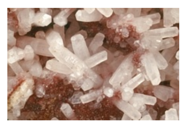
Figure 48: Calcite crystals on drusy quartz from the Jackson mine, Negaunee, Marquette County. Field of view 2.5 x 3.5 cm. A. E. Seaman Mineral Museum specimen No. DCG 544, Jeffrey Scovil photograph.

Northwestern, and Ojibway. Also in Isle Royale National Park, at Hays Point at Copper Harbor, and Silver Creek near Eagle River. 10. North side beaches, Keweenaw peninsula: Stromatolites (Collenia undosa) occur abundantly in some thin limestone layers in the Copper Harbor Conglomerate. These fossil algal colonies, which are known along the strike for at least 15 km, take the form of laterally linked bulbous hemispheroids, 1-30 cm in diameter. They consist of calcite in couplets of light-dark laminations, 20 mm to a few millimeters thick. The darker members contain more ultrafine hematite pigment. Also seen microscopically are radial, fibrous calcite fans and some calcite blades pseudomorphous after gypsum (Elmore and Daniels, 1980; Elmore, 1981). Microscopic native copper (q.v.), cuprite, copper sulfides, and domeykite have been found in some of the stromatolites (Nishioka et al., 1984). 11. Clark mine: Crystals and twinned microcrystals on pumpellyite, some coated by tenorite or cuprite crystals (Bee and Dagenhart, 1984).