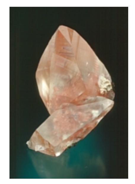
Figure 43: Calcite crystals with native copper inclusions from the Quincy mine, Hancock, Houghton County. 3.5 x 5.5 cm. A. E. Seaman Mineral Museum specimen No. DCG 1159, Jeffrey Scovil photograph.

Counties. Coral groups weathered out of the limestone were widely scattered by Pleistocene glacial action, and are readily found on beaches as pebbles and cobbles rounded by wave abrasion. Dietrich (1983) provides a concise description of the fossil and its occurrence.