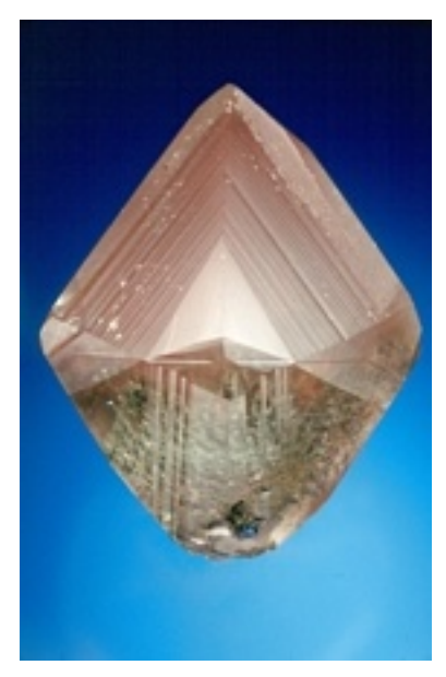
Figure 44: Type 1 twinned crystals of calcite from the Quincy mine, Hancock, Houghton County. 8 × 11 cm. A. E. Seaman Mineral Museum specimen No. JTR 1706, Jeffrey Scovil photograph.